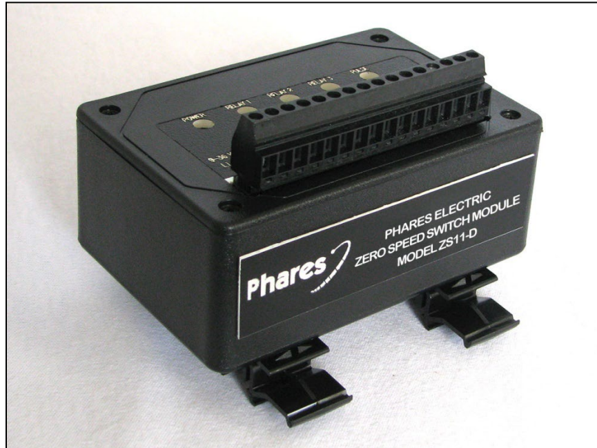
Zero Speed Switch Module Model ZS11