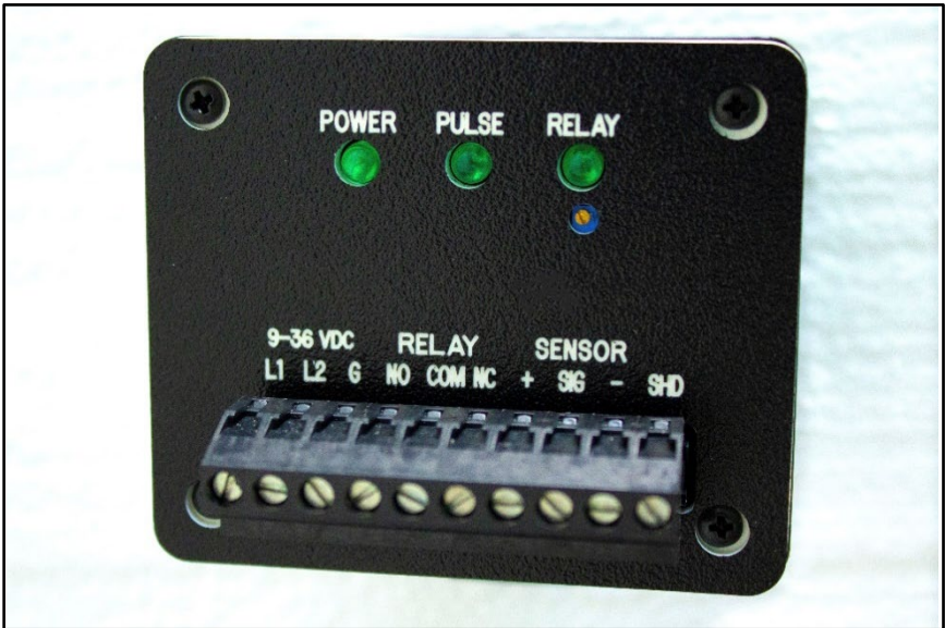
Figure 2. Indicators and Terminal Block (ZS10-D Shown)